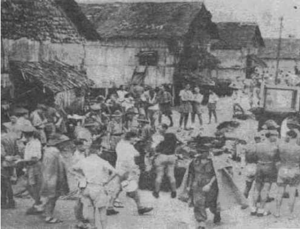
Changi Liberation Day 1945

Two of the pewter badges available to visitors to Changi Chapel & Museum September 2005.