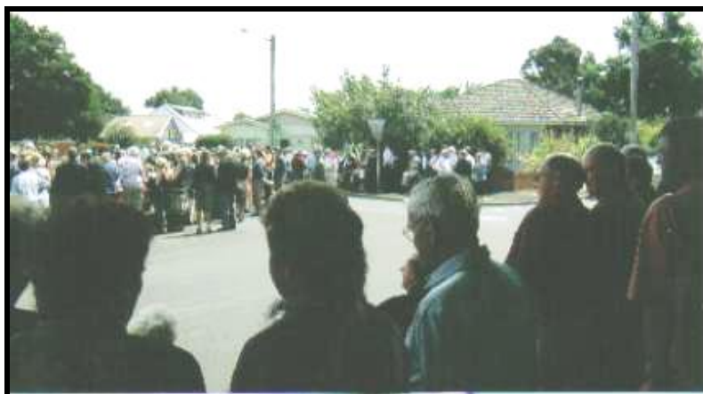
A section of the large crowd gathered to honour a Tasmanian-born hero.