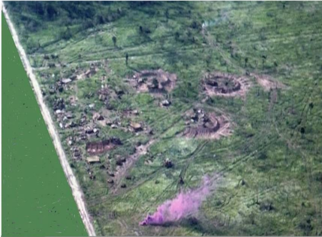
The 102 Battery, Mortar Platoon and Regimental CP positions showing the extent of the NVA penetration

Note that the three guns at the right of the photograph are pointing north while the remaining three guns are pointing east