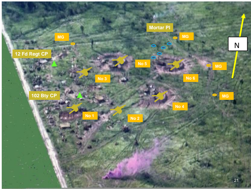
Aerial photograph showing state of 102 and Mortars at of last light 12 May

The photograph of the 102 Battery position below has been rendered from a photograph taken by then Gunner Ross Alexander on the 13 May 1968. It shows the gun and mortar position as it was at last light on 12 May 1968.