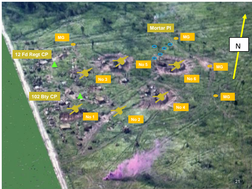
Aerial photograph showing state of 102 and Mortars at of last light 12 May

The photograph of the 102 Battery position below has been rendered from a photograph taken by then Gunner Ross Alexander on the 13 May 1968. It shows the gun and mortar position as it was at last light on 12 May 1968.