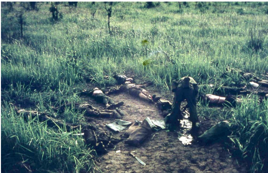
NVA dead in front of the 102 guns

As the Australians began to recover and count the cost it was revealed that nine Australians had been killed and twenty eight wounded. Jensen's Mortar Line bore the brunt of the casualties with five dead and eight wounded out of eighteen men. Two Gunners were dead and four wounded. Fifty two NVA dead lay strewn around the guns and mortars and one NVA soldier was taken prisoner. Two of Jensen's mortars were damaged and one 105 mm Howitzer was damaged beyond immediate repair and had to be flown out, another had both tyres blown out and a hole in its trail but the gun stayed in action. The 102 Battery O sized bulldozer was riddled with small arms fire and also had to be back loaded. Every piece of canvas (used for ammunition bays) was shredded and all personal sleeping tents ('Hoochies') riddled with bullet and shrapnel holes.