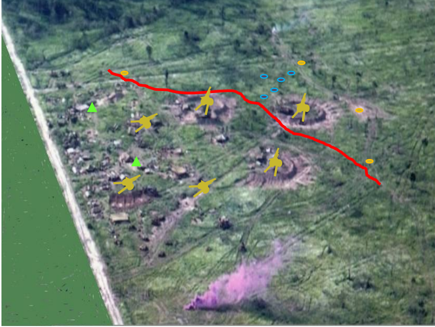
The 102 Battery, Mortar Platoon and Regimental CP positions showing the extent of the NVA penetration

Note that the three guns at the right of the photograph are pointing north while the remaining three guns are pointing east